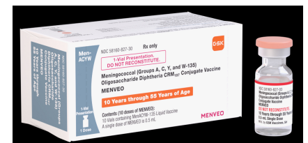
Figure 4. The new Menveo ready-to-use vial (pink cap) does not require reconstitution.