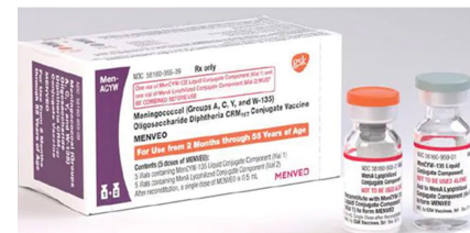
Figure 5. The two-component Menveo presentation requires the reconstitution of the MenA lyophilized powder vial (orange cap) with the MenCYW-135 liquid vial (gray cap).

ISMP would like to acknowledge those who reported concerns with the two-component vaccines and encourage organizations to continue to provide feedback to us so we can work with manufacturers and the FDA to improve the safety of product labeling and packaging.