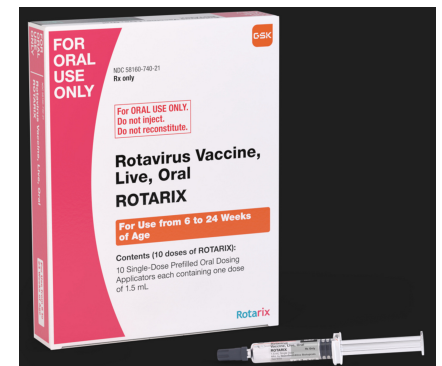
Figure 2. The new Rotarix oral dosing applicator-only presentation does not require reconstitution.

Historically, Rotarix has only been available as a two-component product that requires reconstitution of lyophilized vaccine with the liquid contained in an oral dosing applicator,