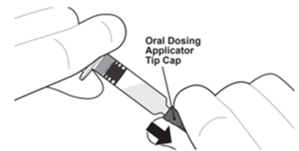
Figure 3. Remove and discard the oral dosing applicator tip cap prior to administration.

which looks like a prefilled syringe, using a supplied transfer device ( Figure 1 , page 1). However, there have been long-standing issues with practitioners inadvertently omitting reconstitution and using the liquid in the syringe by itself. Or the vaccine was mixed, transferred to a parenteral syringe, and injected. To avoid the need for dilution and to facilitate the correct route of administration, the new, fully liquid formulation is provided in an oral dosing applicator ( Figure 2 , page 1), and the tip does not allow for a needle to be attached ( www.ismp.org/ext/1032 ). However, practitioners still need to be educated to never transfer the vaccine into a parenteral syringe for injection. Also, to avoid a choking hazard, those administering the vaccine must ensure the protective cap on the dose applicator is removed and discarded prior to giving the dose ( Figure 3 ).